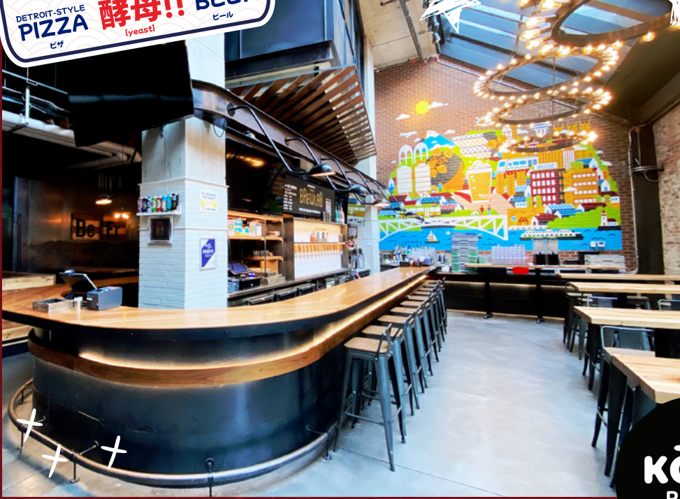
Pike St. Bar