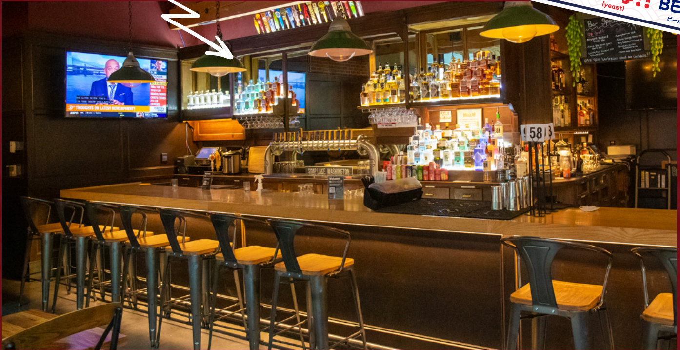
The Speakeasy boasts a fully stocked bar with 16 Taps